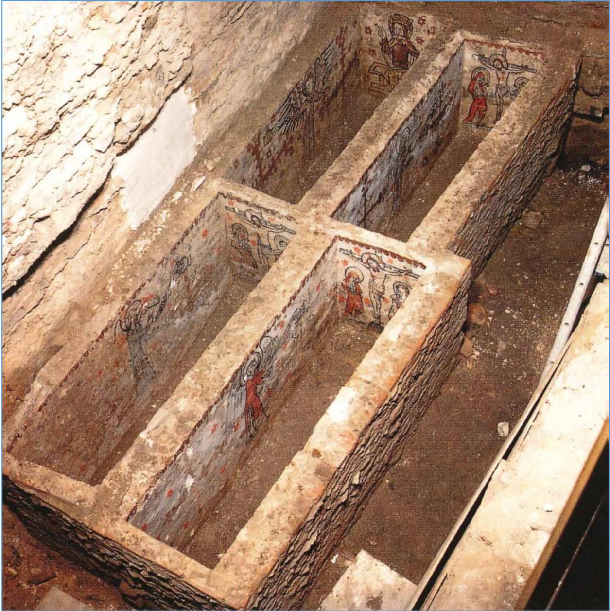
Figure 5 Fourteenth-century painted tombs discovered in St Salvator Cathedral, Bruges, in 1993. Photo: Magenta Brugge. Reproduced from Middeleeuwse murrschilderingen in Vlaanderen (Brussels, 1994), 71.

penitence, intercession, resurrection and salvation; it has been suggested that their repetitive employment reflects the growing powers of the mendicant orders, who were of course