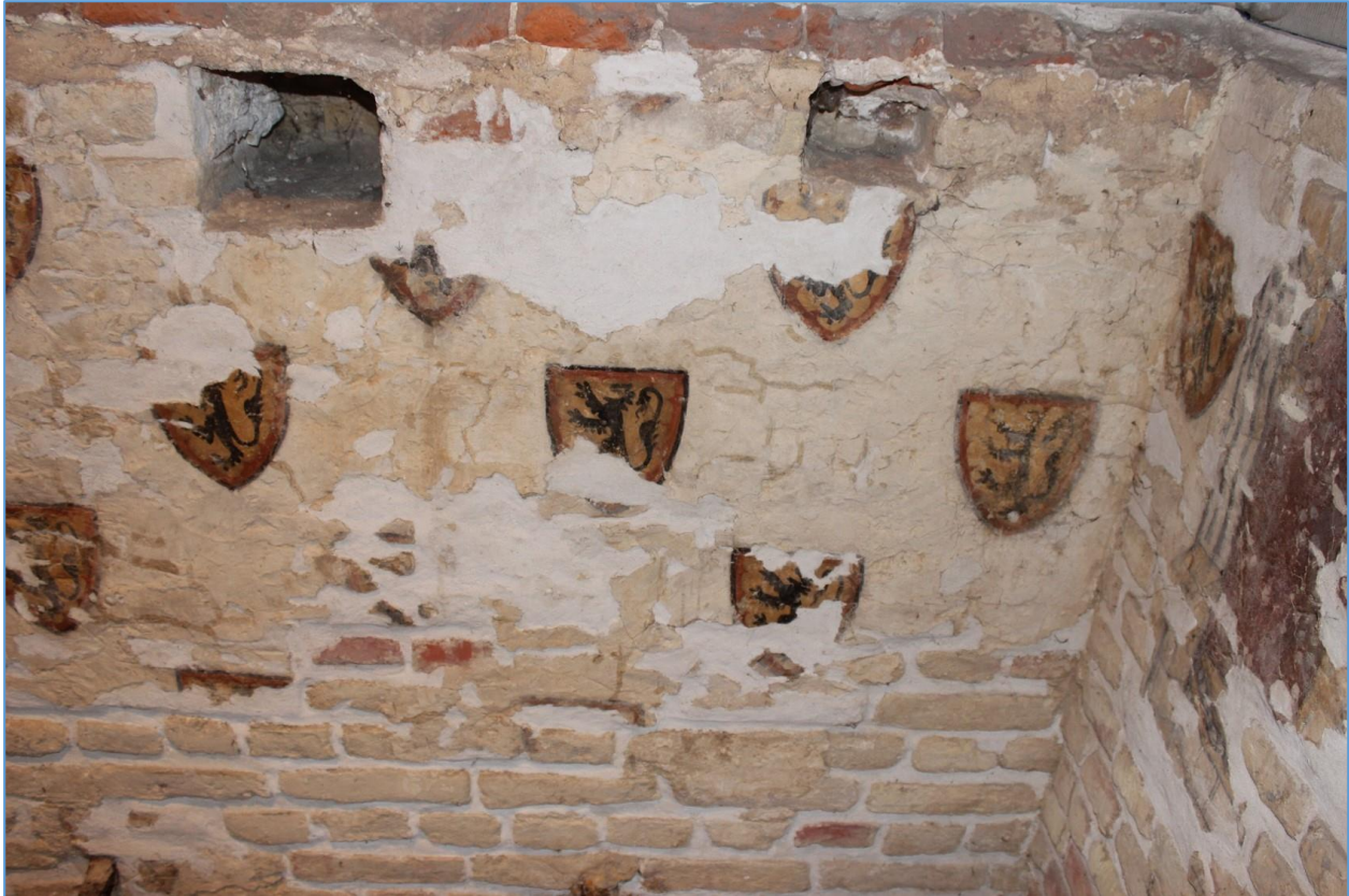
Figure 6 Painted arms of Robert of Cassel in his tomb at Warneton. 1331.

yellow, green, red and brown, the whole arranged in a geometric pattern. 18 Robert's tomb, therefore, had as much in common with the luxuriously decorated salles aux écus of contemporary Flemish and French castles as it did with other instances of such burials. 19 The tacit dialogue between the multiple Cassel arms and the more customary iconographic repertoire of the painted tombs adumbrated the spiritual benefits that noble status afforded, even in death. If the recurring intercessional saints and censuring angels that decorated analogous zones in other