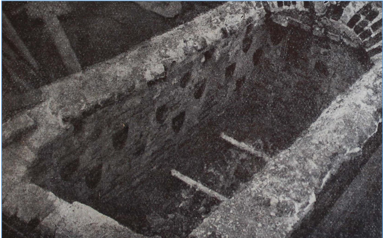
Figure 2 Photograph of the tomb of Robert of Cassel shortly after its excavation.

unearthed in the area of the old choir—a privileged space—Van Zuylen van Nyevelt was certain. On the lateral sides of the interior were the arms Or, a lion rampant sable within a border