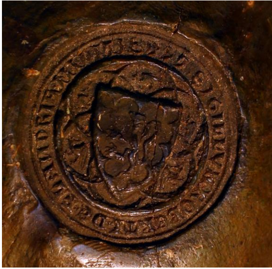
Figure 3 Impression of the counterseal of Robert of Cassel appended to a document of February 8, 1327. Archives Départementales du Nord, Lille, B 413, no. 5.790.

discovered in the remains of a lead coffin which, judging from several iron rings and hinges, was once enveloped by a larger vessel of oak. The rings enabled staves to be passed through for transportation. No other material goods of