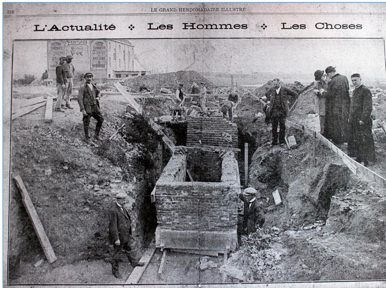
Figure 1 Photograph of newly rediscovered tomb of Robert of Cassel being prepared for transportation in 1924.

the nave and choir of the medieval church. Of particular interest was the fact that the interior walls of two of the sarcophagi were painted with fresco decorations that included